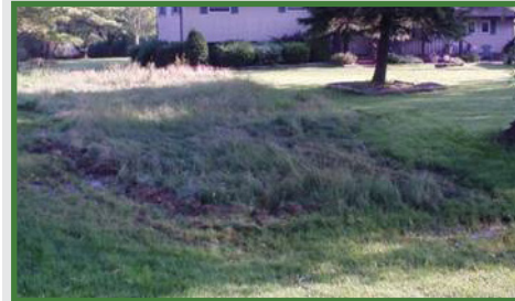
Overgrown septic field

Health Department and/or IDEP coordinator