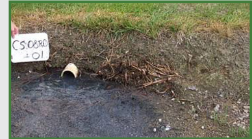
Cheater pipe from septic field