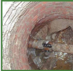
Broken sanitary sewer